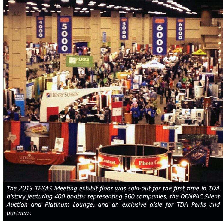
The 2013 TEXAS Meeting exhibit floor was sold-out for the first time in TDA history featuring 400 booths representing 360 companies, the DENPAC Silent Auction and Platinum Lounge, and an exclusive aisle for TDA Perks and partners.

The 2014 TEXAS Meeting is scheduled for May 1-4, in San Antonio. Program information will be available in late summer and housing information will be available December 1 on texasmeeting.com .